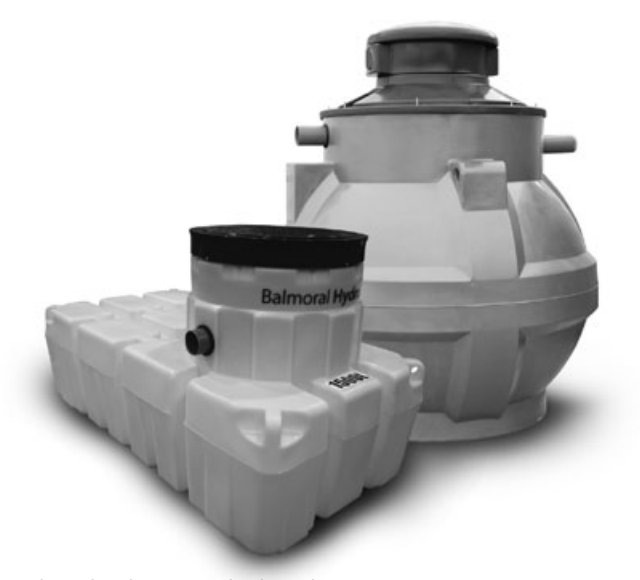
Balmoral HydroStore and Balmoral RWH-ST

It is recommended to position the tank at a minimum distance from the face of the building using the '45° degree rule' to avoid affecting either the structural integrity of the building or the tank. In the event of uncertainty or if the ground conditions are unsuitable, it is recommended that the unit is a minimum distance of 5m from the face of the building. Plans should always be approved by the controlling authority and signed off by the building inspector after installation.