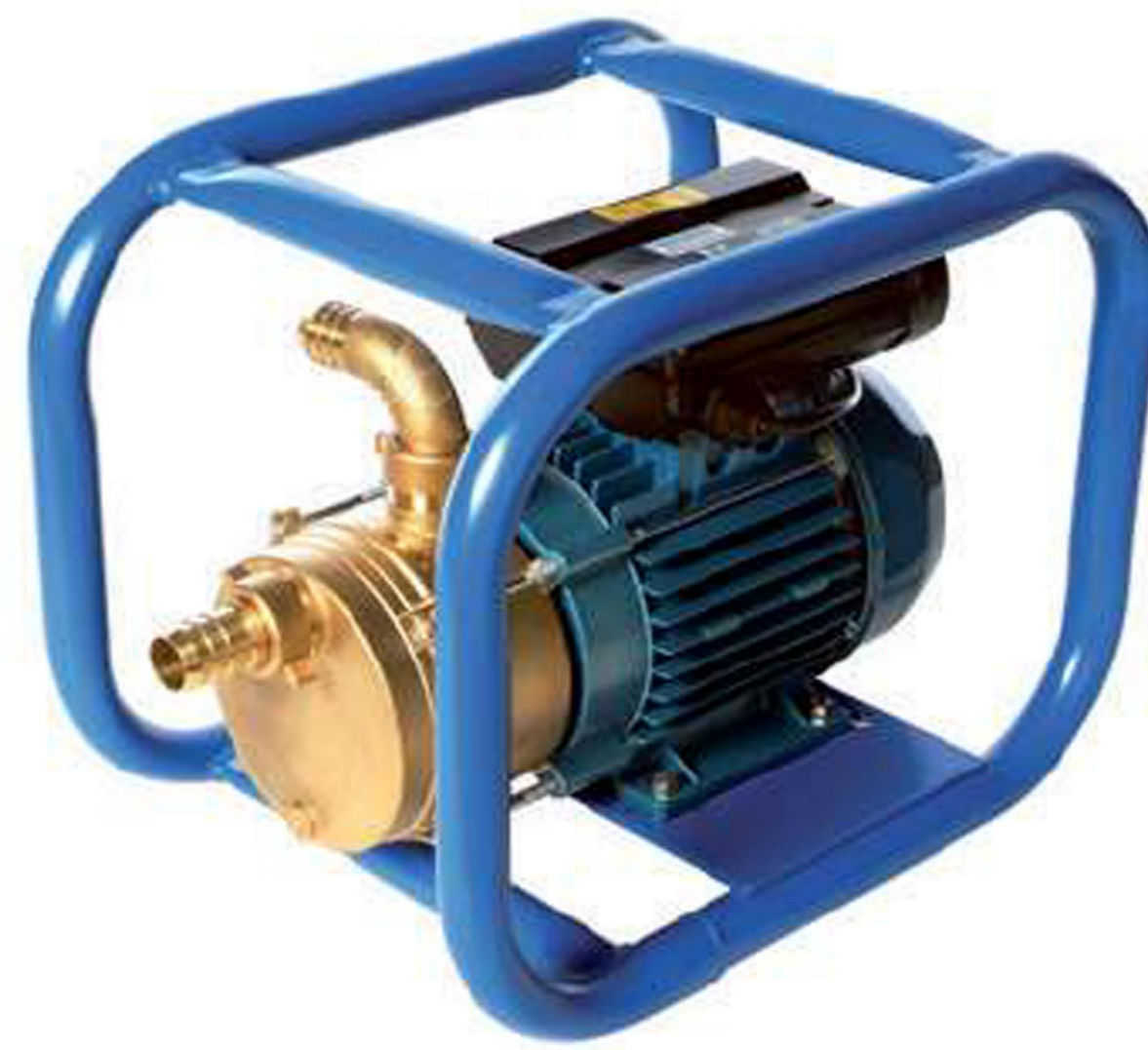
ENM25 in frame