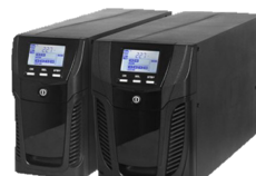
Servicing & Commissioning