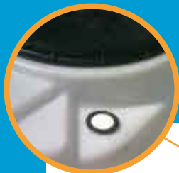
Optional 40mm Vent for sealed systems