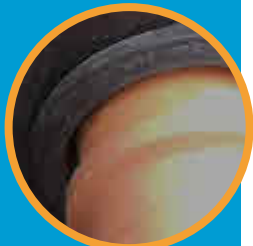
Inlet Pipe 110mm as standard.