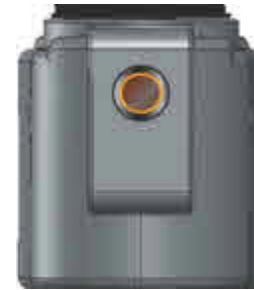
Outlet End Elevation