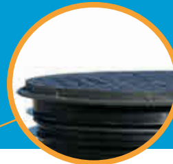
Lockable Access Cover