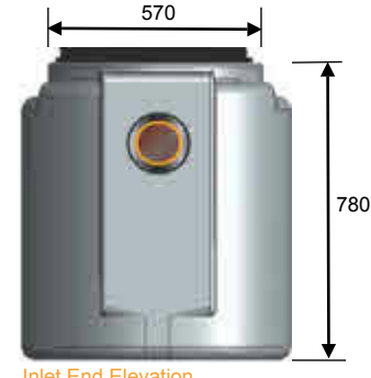
Inlet End Elevation