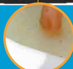
Secondary settlement chamber This chamber traps excess oil and grease that migrates from chamber 1 when full. The secondary settles it out