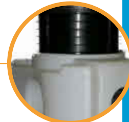
Optional extension riser 235mm high