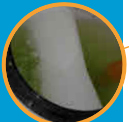
Grease Baffle This unique baffle design separates the two chambers as well as channeling the flow of suspended grease and oil