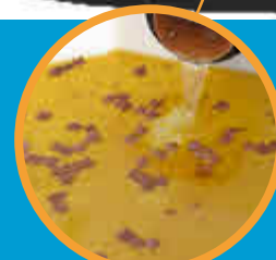
Primary settlement chamber This large chamber allows oils and greases to settle out at top and also retains solids in the base.