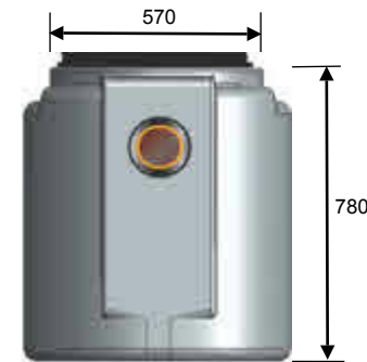
Inlet End Elevation